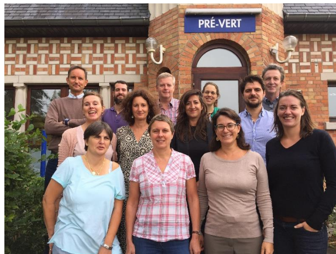
The APEEE and APEEE Services Team