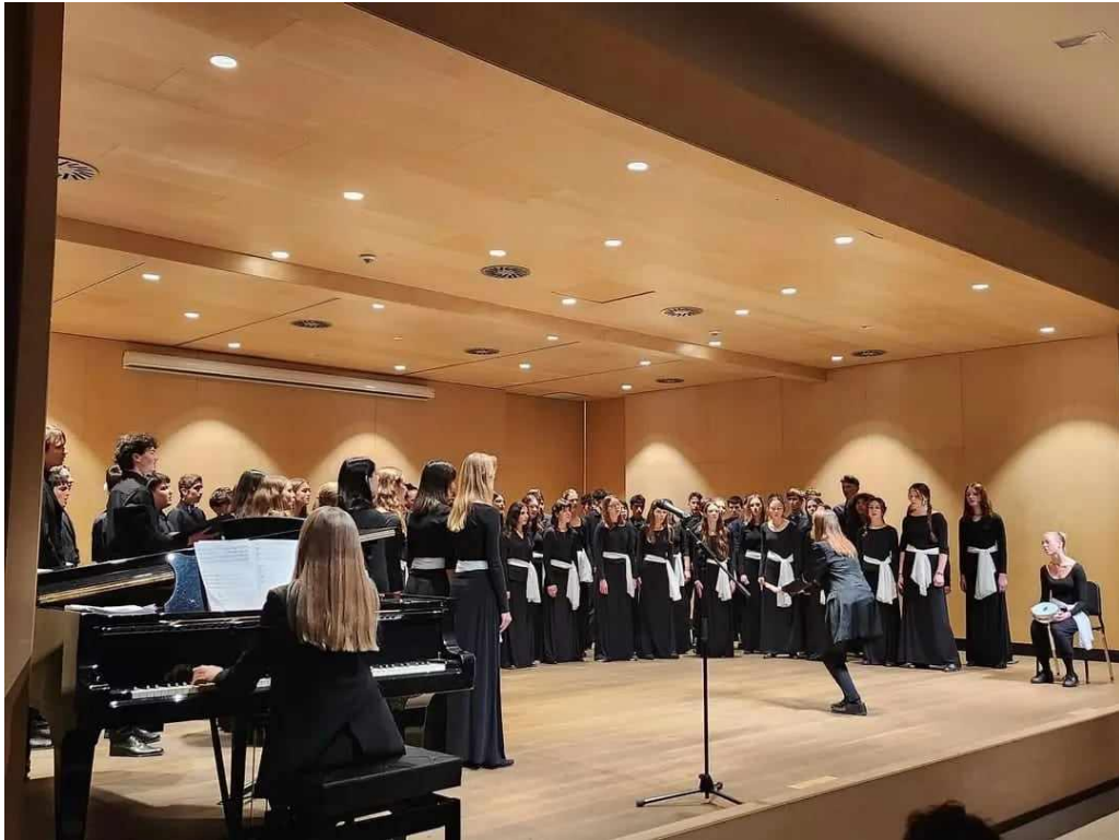
Conservatorio Municipal de Música de Barcelona