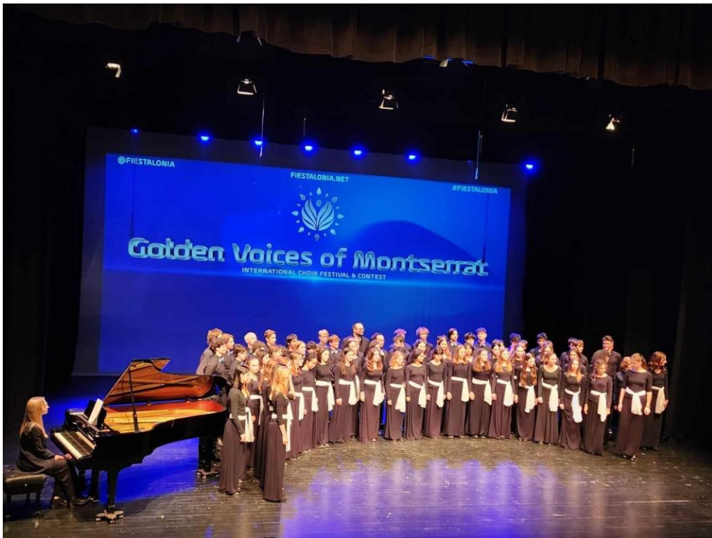
Awards Ceremony and Gala Concert